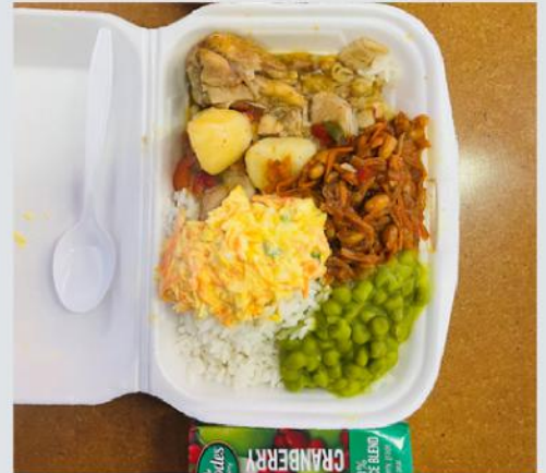
Students are provided with meals during the weekly lesson.